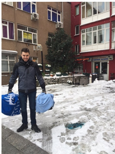
Donald trudging through the snow with two kitties to be sterilised

Sterilisations to date: 23 Catmerons!!! Spayed: 19 Neutered: 4