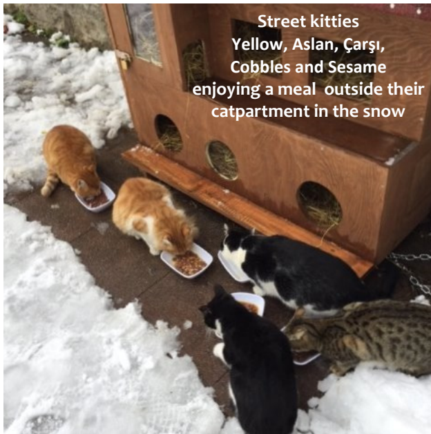
Street kitties Yellow, Aslan, Çarşı, Cobbles and Sesame enjoying a meal outside their catpartment in the snow