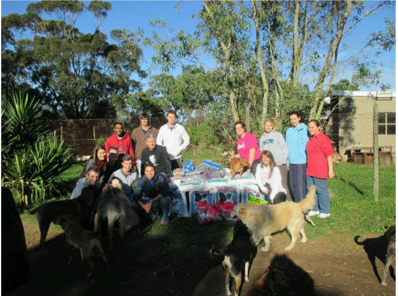
The KPMG team with their magnificent donation of food.