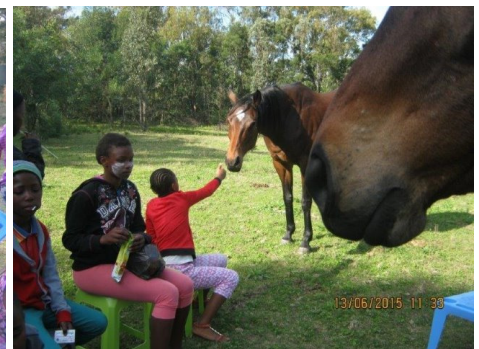
CHILDREN INTERACTING WITH THE ANIMALS AND ENJOYING THEIR SNACKS AND COOLDRINKS