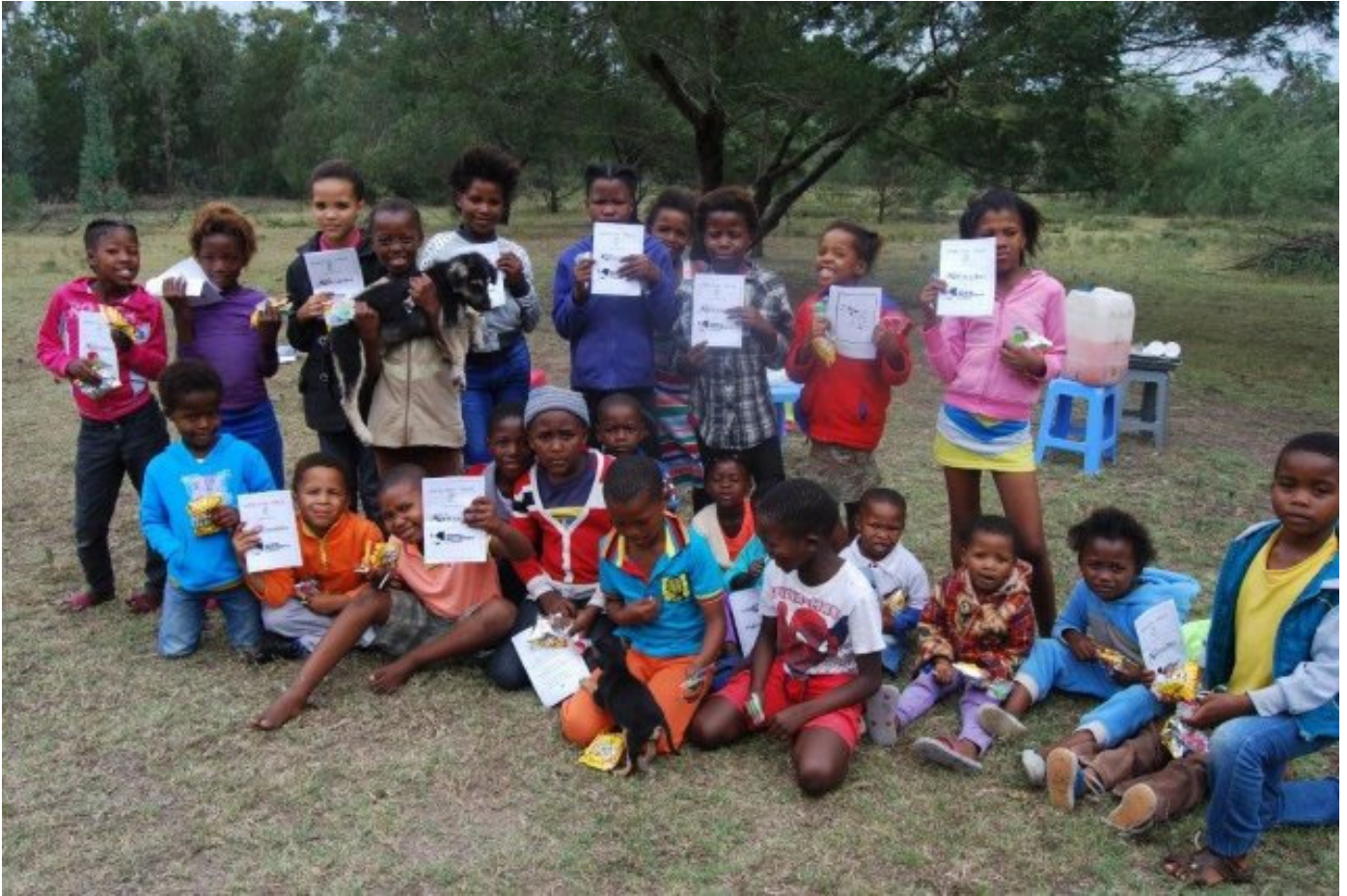
CHILDREN ATTENDING A CLASS WITH THEIR OPERATION TOUCH BOOKLETS