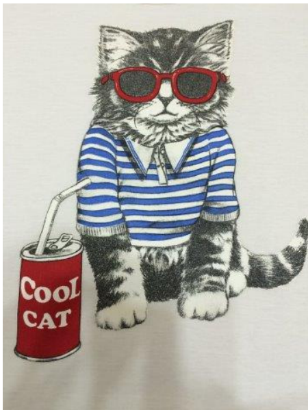
ONE COOL CAT