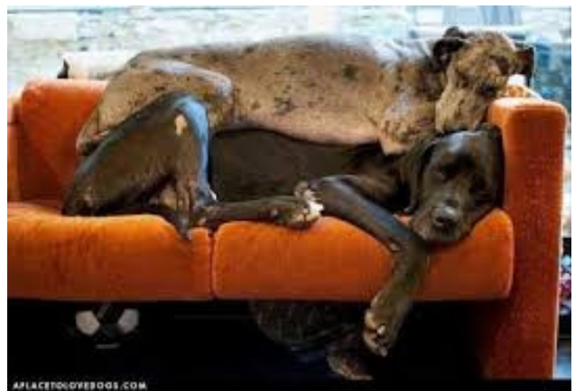
TWO HOT DOGS